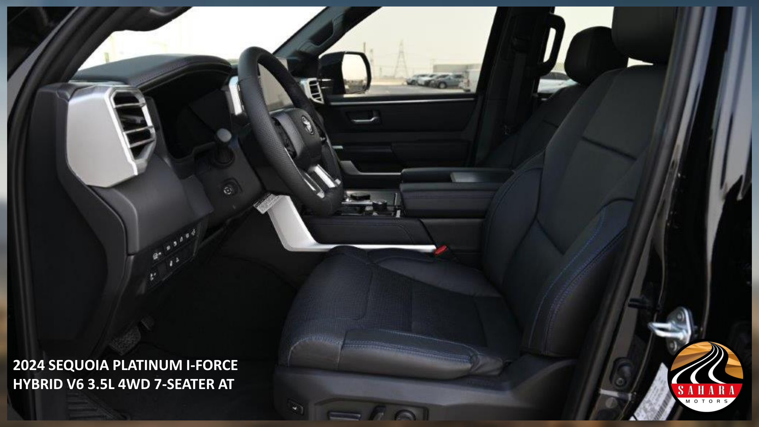
2024 SEQUOIA PLATINUM I-FORCE HYBRID V6 3.5L 4WD 7-SEATER AT