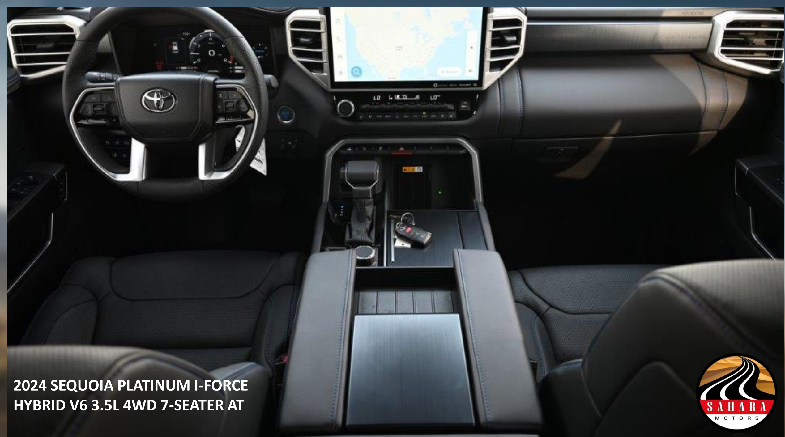
2024 SEQUOIA PLATINUM I-FORCE HYBRID V6 3.5L 4WD 7-SEATER AT