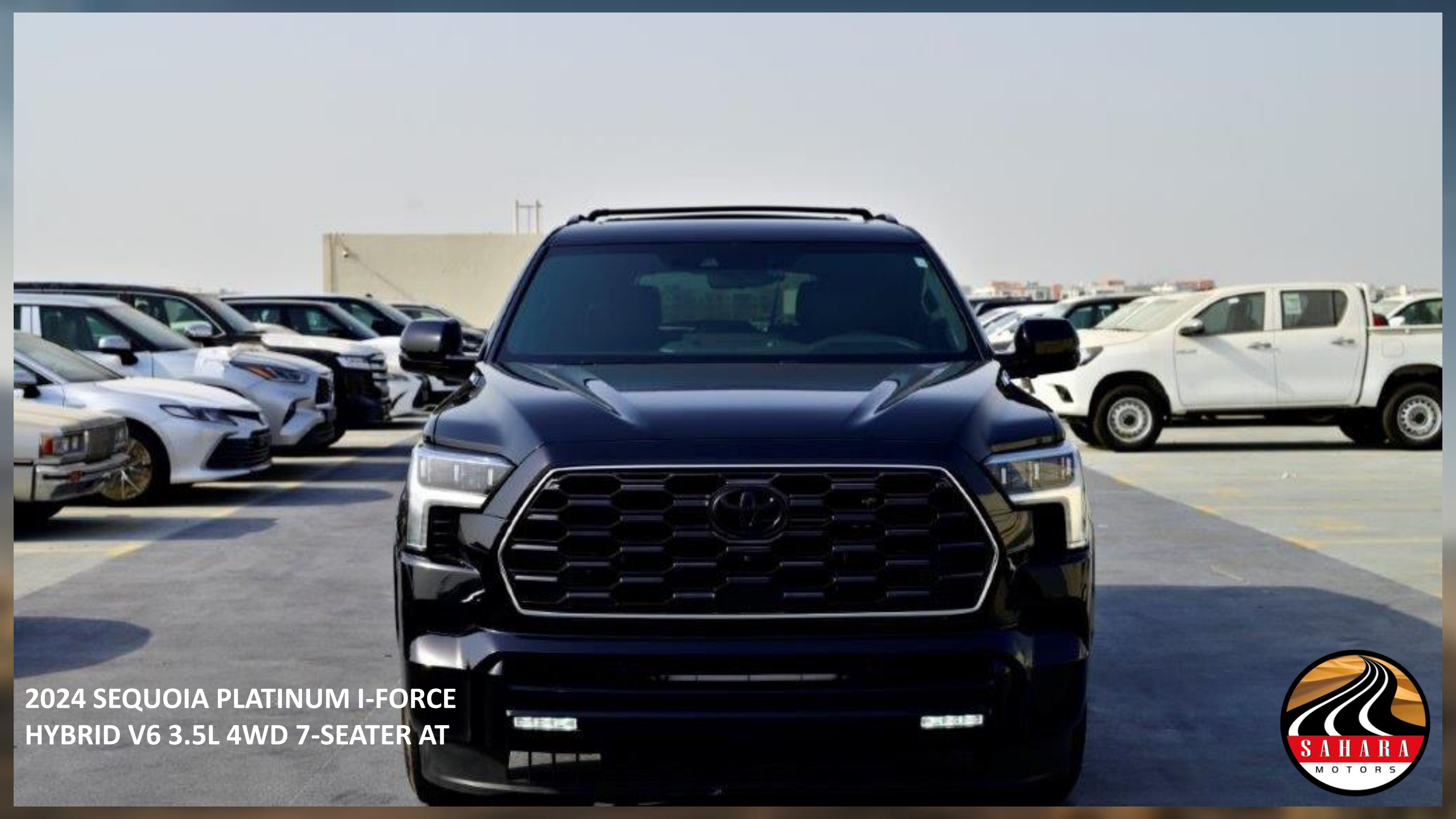
2024 SEQUOIA PLATINUM I-FORCE HYBRID V6 3.5L 4WD 7-SEATER AT