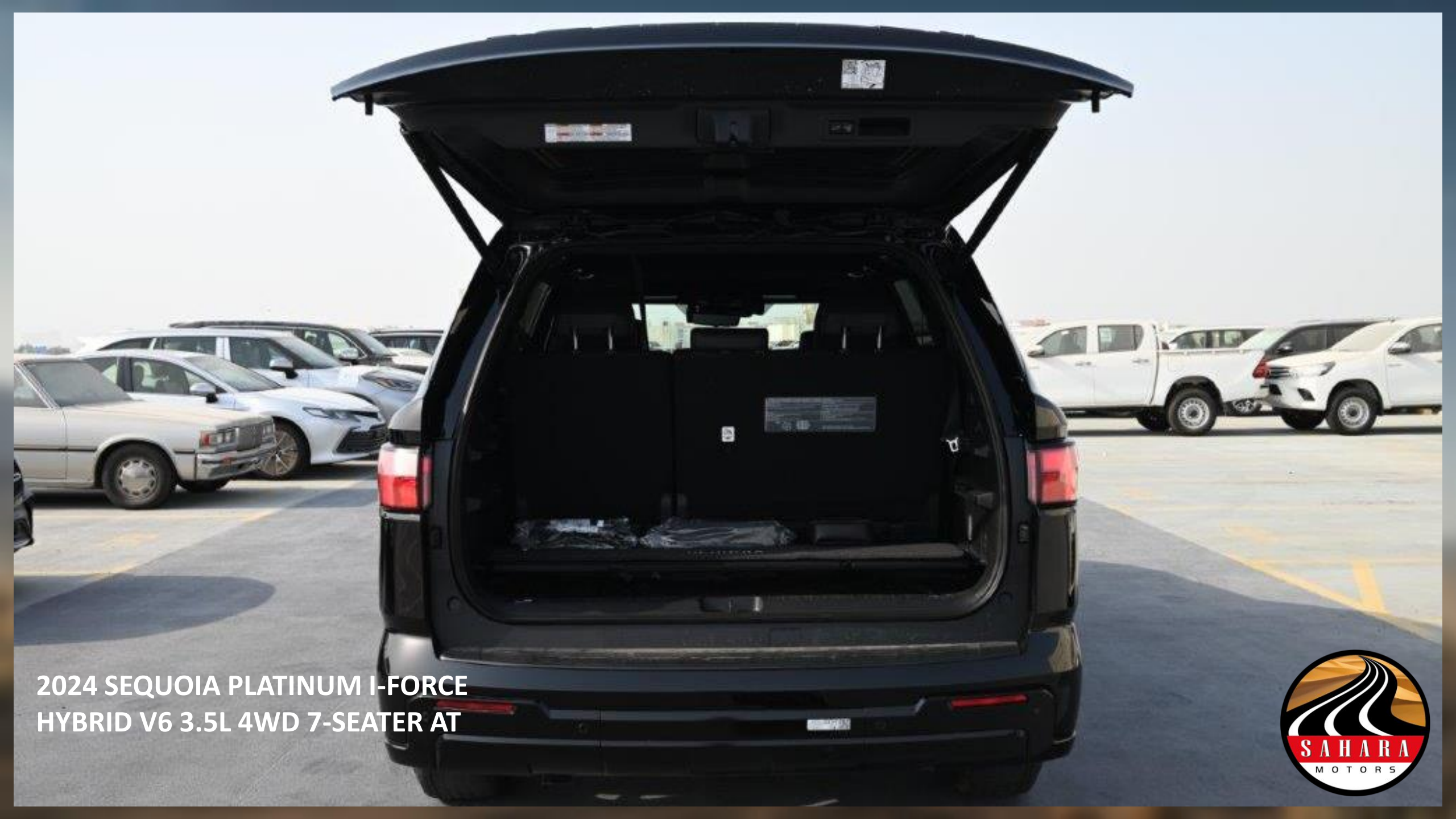
2024 SEQUOIA PLATINUM I-FORCE HYBRID V6 3.5L 4WD 7-SEATER AT