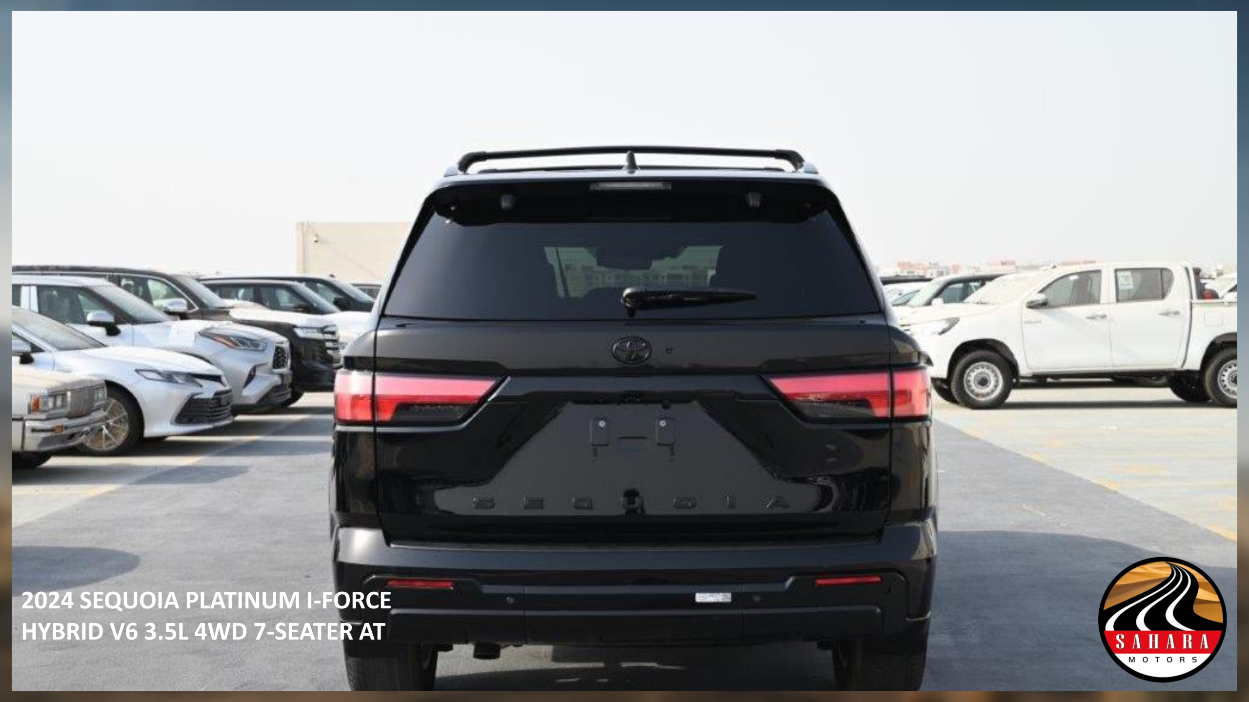
2024 SEQUOIA PLATINUM I-FORCE HYBRID V6 3.5L 4WD 7-SEATER AT