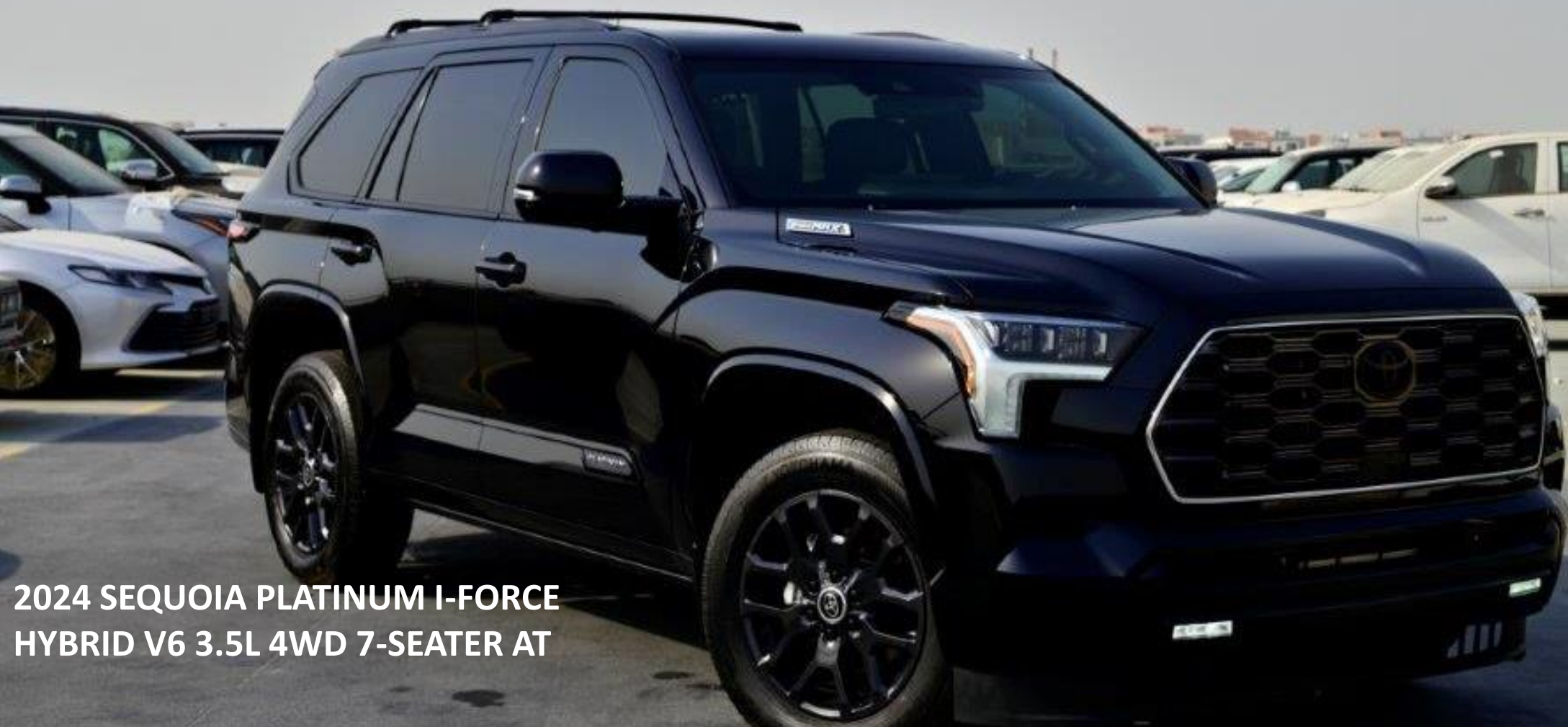
2024 SEQUOIA PLATINUM I-FORCE HYBRID V6 3.5L 4WD 7-SEATER AT